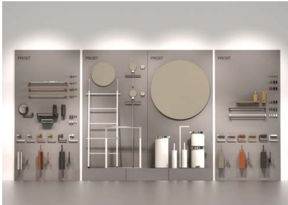
Wall elements: 110 x 110 cm Podiums: 110 x 35 x 20 cm